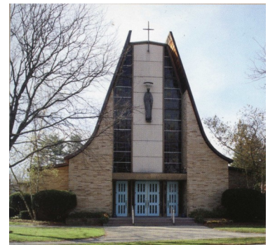
The Church of Regina Coeli, Hyde Park, NY