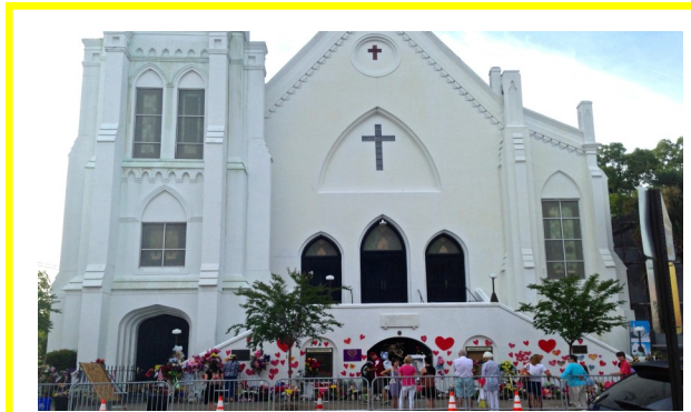
Mother Emanuel AME memorial. Memorial items were removed daily by members of the Charleston, Archives, Libraries and Museum Council (CALM).

The Charleston Archives, Libraries, and Museum Council (CALM), a local, professional organization, realized at once that the memorial items needed to be collected and preserved. They began taking shifts to clean the memorial site and to bring in any items that were susceptible to the hot, humid, and rainy weather of summertime in Charleston.